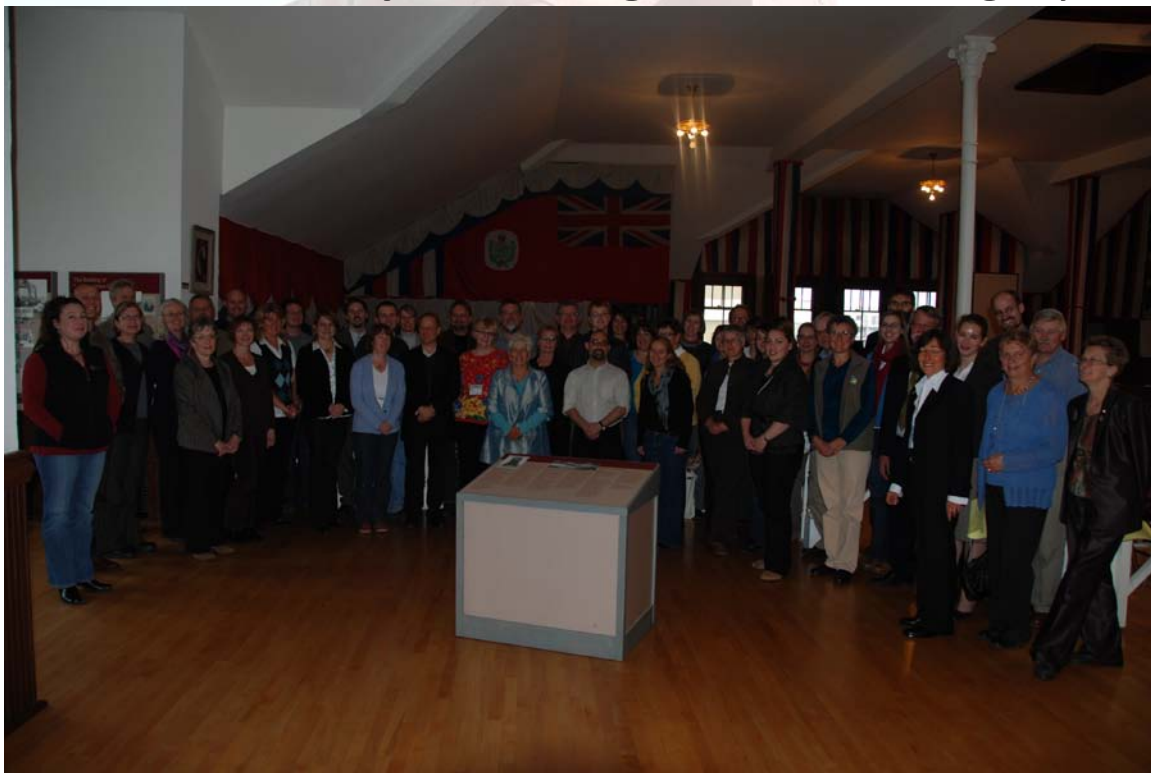
2009 Municipal Heritage Forum – Edmonton