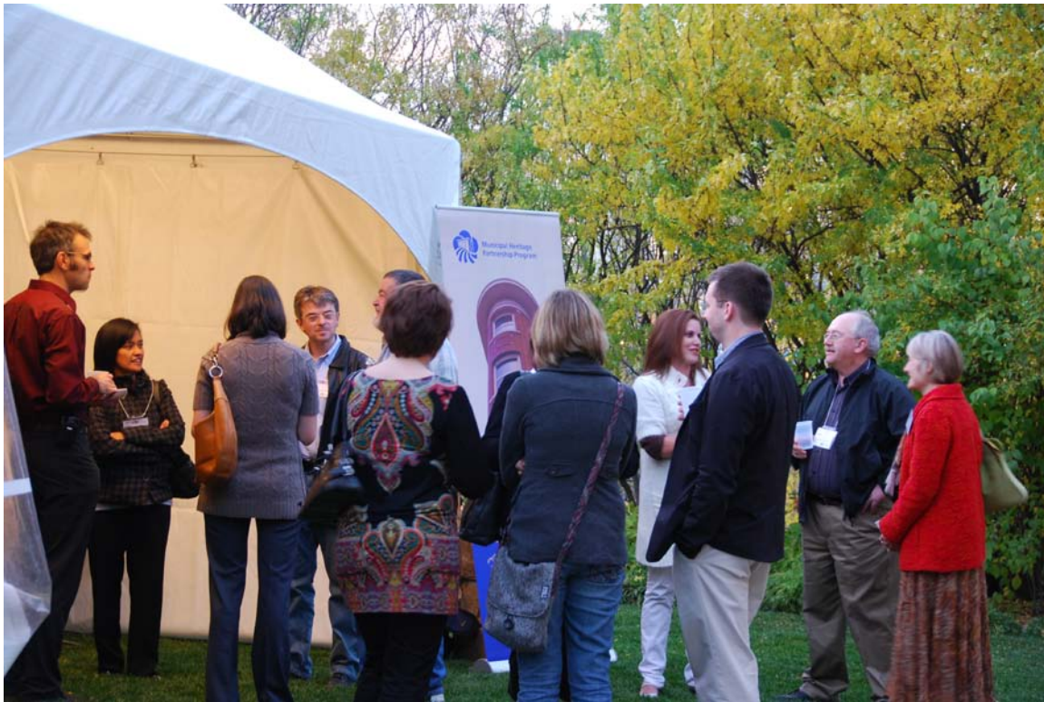
2010 Municipal Heritage Forum – Calgary