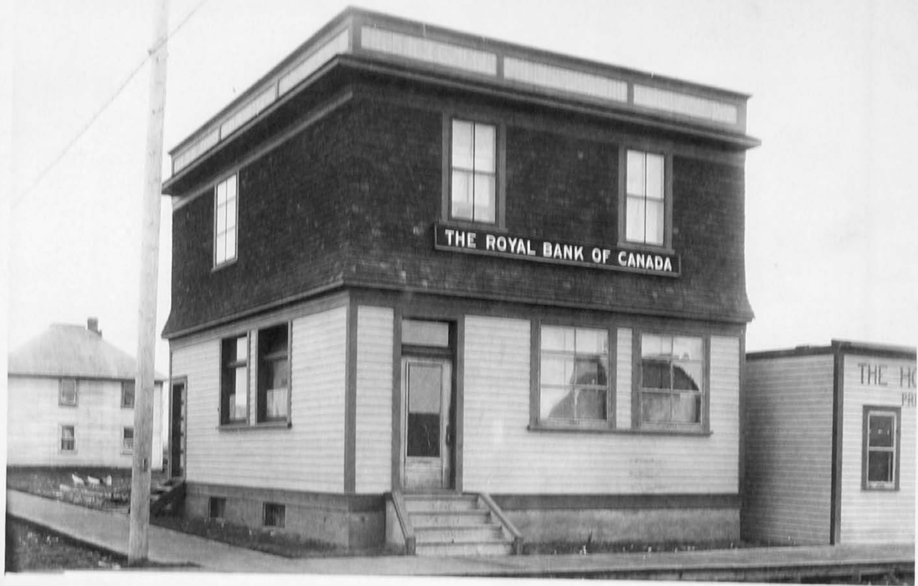
ROYAL BANK, HOLDEN.