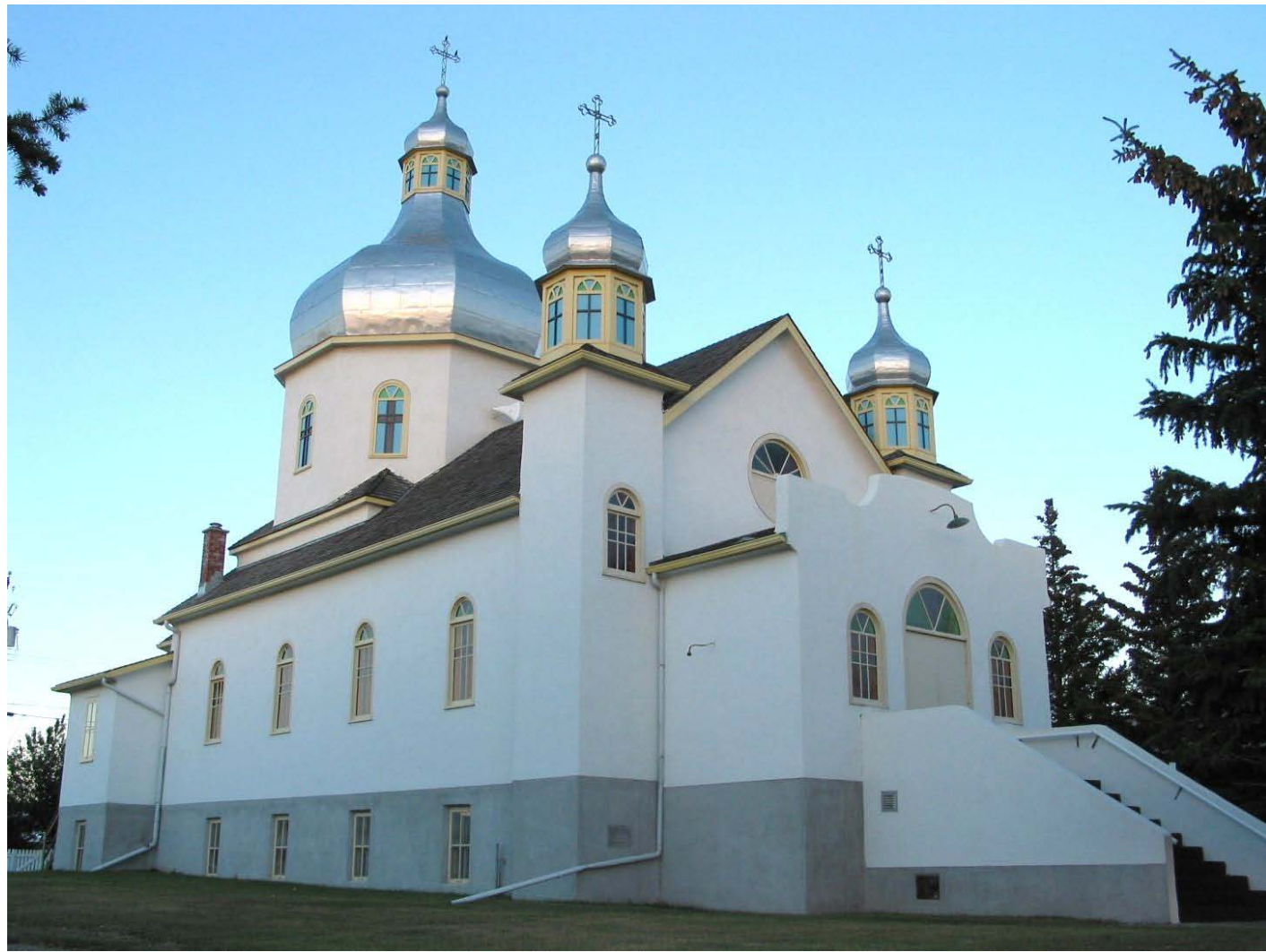
Holden Ukrainian Catholic Church