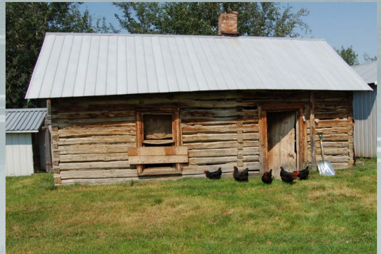
Farm House – 1933 – a chicken coop today!